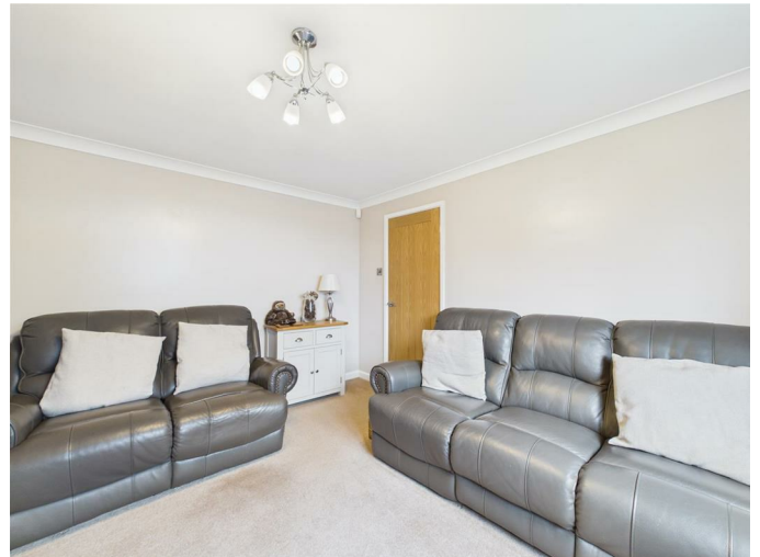
Lounge 12'9" x 11'9" (3.89m x 3.58m)

Featuring an electric fire with living flame effect in feature fireplace, behind which is a balanced flue and gas point (currently capped off). Gas Fired Hot Water radiator and Double glazed windows with leaded lights over looking front of home