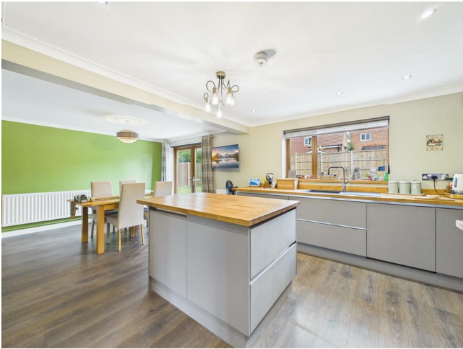
Kitchen / Diner 22'1" x 11'8" (6.73m x 3.56m)

Truly the heart of the house, featuring a wealth of fitted cupboards and extra deep drawers. many with extra shelves, recesses, and modern storage solutions with slow closing functions. Incorporating a composite sink, stunning island unit with Oak block top, integrated Neff Double oven featuring hide away doors, integrated Bosch Dish Washer, and full height fridge, window and patio doors overlooking rear garden, access to former garage conversion, leading to