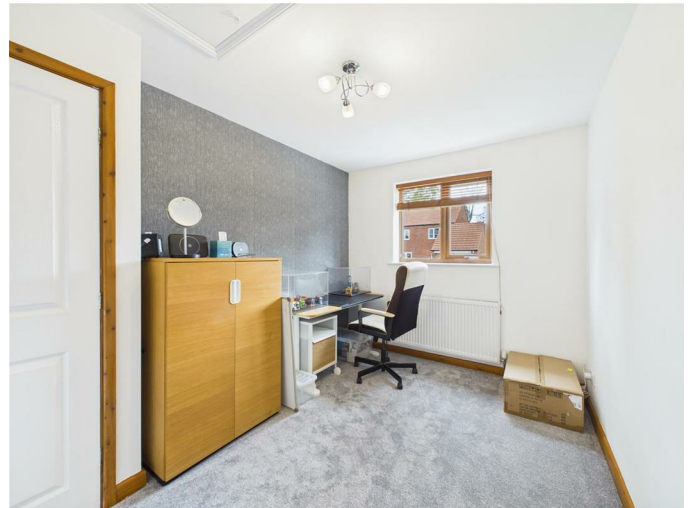
Bedroom Three 11'9" x 8'4" (3.58m x 2.54m)

Overlooking rear garden, this double room has a loft hatch and loft access with fitted ladder leading to boarded loft