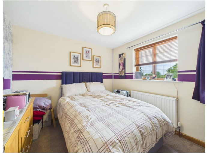
Bedroom Two 10'0" x 9'6" (3.05m x 2.90m)

Double room over looking front with UPVC leaded light windows and double radiator