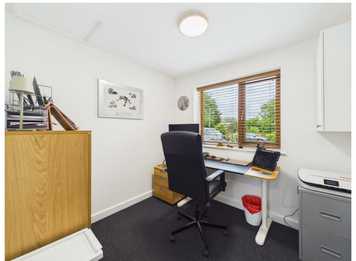
Home Office / Den / Play Room 7'9" x 8'3" (2.36m x 2.51m)

Currently fitted out as an office, this flexible room could suit many purposes for a family.