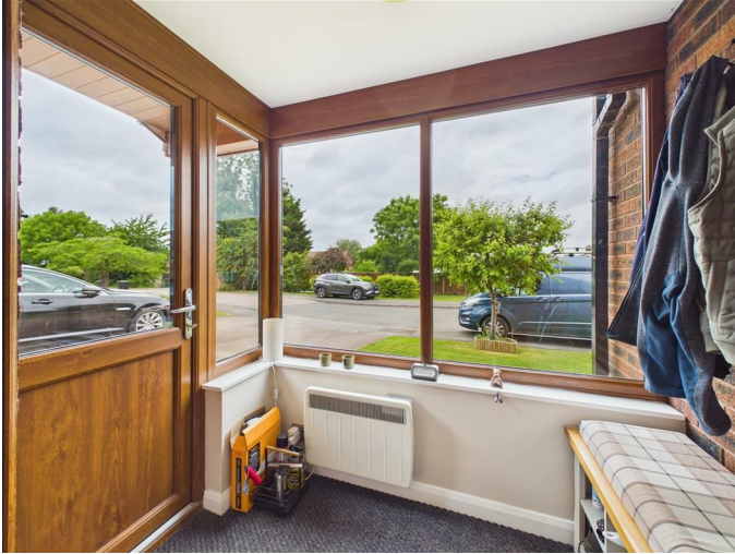
Porch 4' 3" x 6'7" (1.22m 0.91m x 2.01m)

Entered via a woodgrain effect UPVC 5 Lever security door with double glazed windows, electric radiator