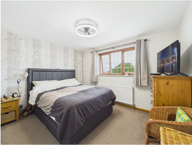
Bedroom One 11'9" x 10'0" (3.58m x 3.05m)

Situated at the front of the home and featuring UPVC double glazed windows, radiator and door to en suite