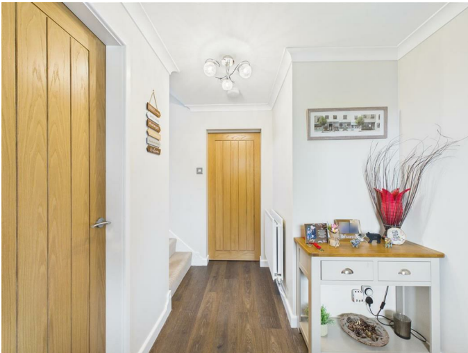
Hallway 9'5" x 6'7" (2.87m x 2.01m)

This welcoming room has light coloured vinyl plank effect flooring, gas fired hot water radiator and doors to Lounge Kitchen / Diner and Downstairs WC, Plus stairs to the upper rooms