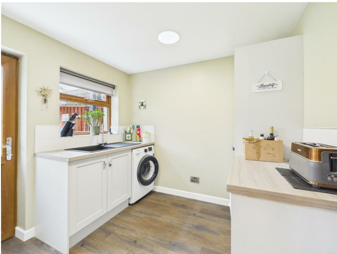
Utility Room 8'8" x 8'3" (2.64m x 2.51m)

With its own sink, integrated freezer, plumber for washer and dryer, door to office, rear garden and hot tub.