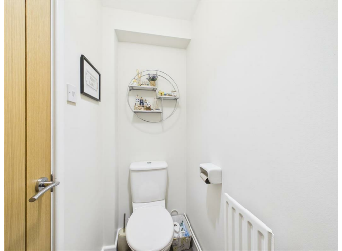
Guest WC / Cloakroom 5'10" x 2'11" (1.78m x 0.89m)

Featuring a 2 piece suite in white with under sink storage