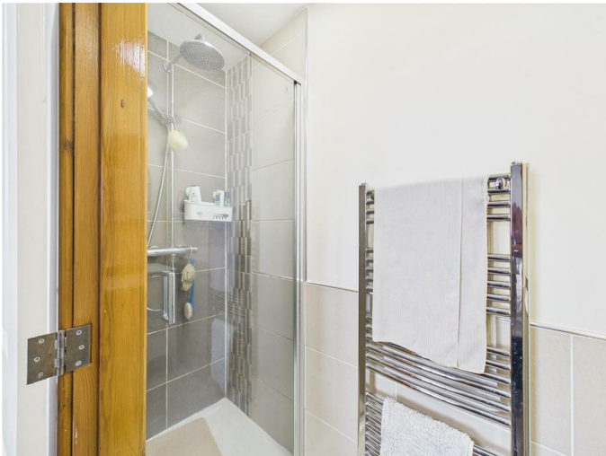
En Suite Shower Room 8'8" x 2'7" (2.64m x 0.79m)

With shower including rainfall and hand set shower heads and sink with storage under. Chrome upright towel radiator